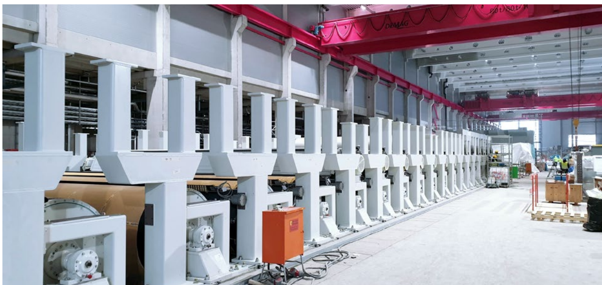
Construction site Progroup Paper PM3, date: 20.01.2020 Sandersdorf-Brehna, Germany

corrugator will be equipped to operate at a speed of up to 400 m/min and with a working width of 3.35 m will blend seamlessly into the Progroup mill system. Single-wall and double-wall Next Board® grades of varieties B, C, E and resulting combinations will be produced. The plant will create more than 50 new jobs and apprenticeships. According to current schedule, we expect to commence production in 2021.