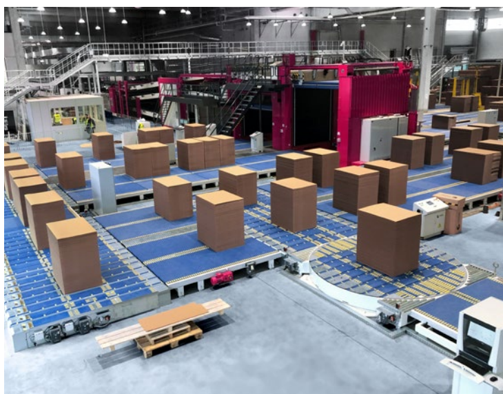
Start of trial production at our new corrugated sheetboard production site Eisfeld, Germany